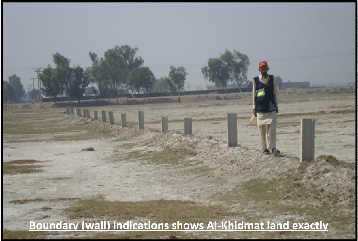
Boundary (wall) indications shows Al-Khidmat land exactly